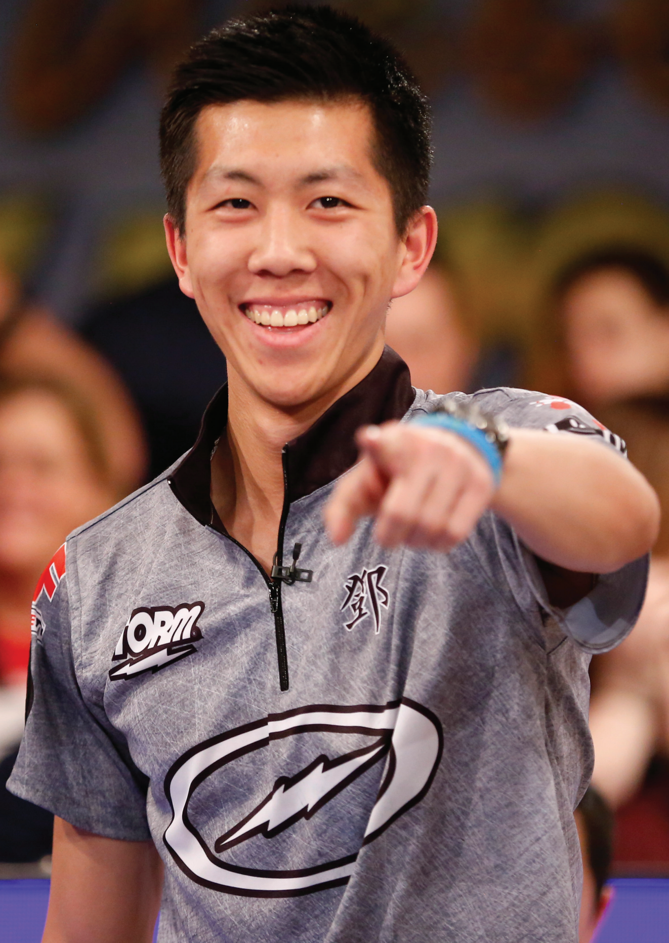
Happy Days A lot of trial and error led to Tang's recent successes.